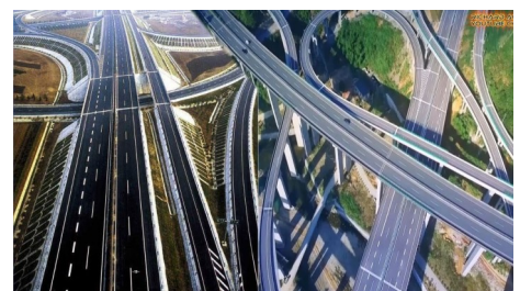
A photo of a part of China's amazing highway network