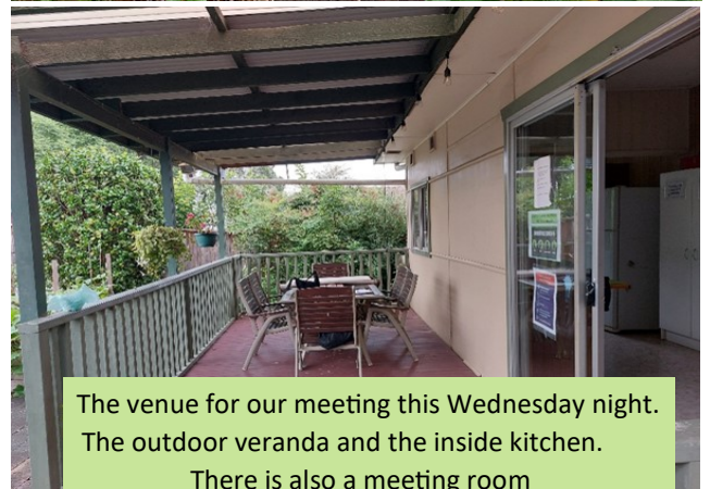
The venue for our meeting this Wednesday night. The outdoor veranda and the inside kitchen. There is also a meeting room