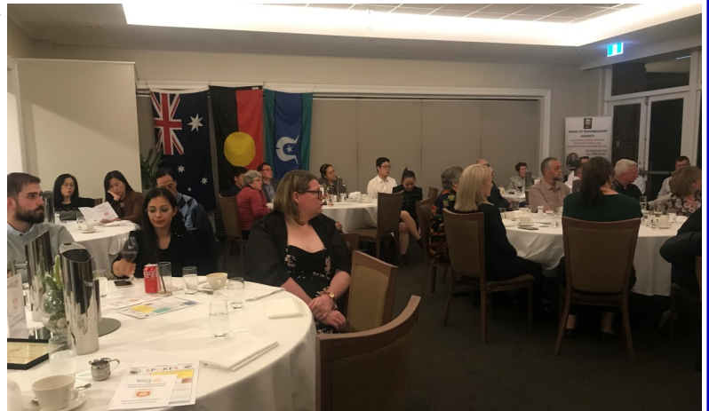
Part of the assembled gathering