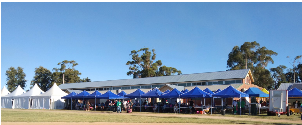
The Showcase on the left and covered seating and tables with pavilion at back