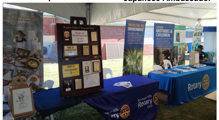
The POW Stand in the Showcase area