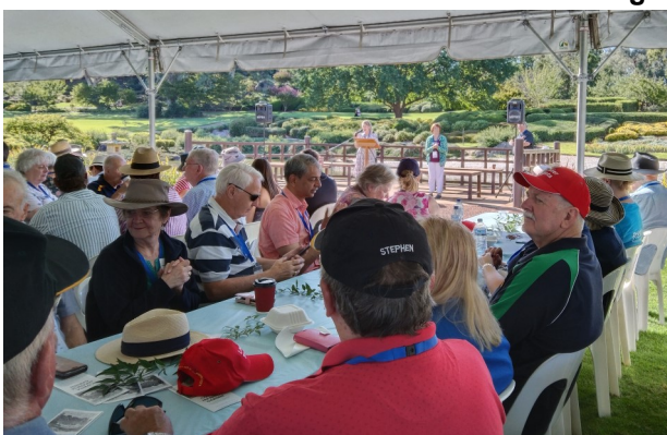
Brunch at the Japanese Gardens Sunday