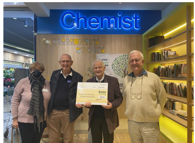
The presentation last Thursday