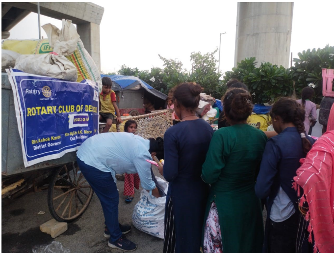
Some photos of the Delhi Ridge club assisting flood victims