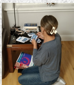
Our Champion card Folder