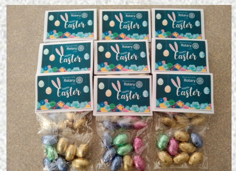
The finished product