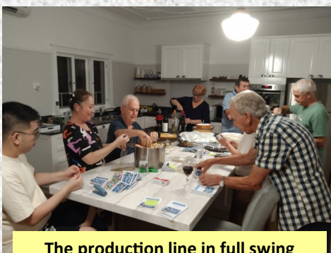
The production line in full swing