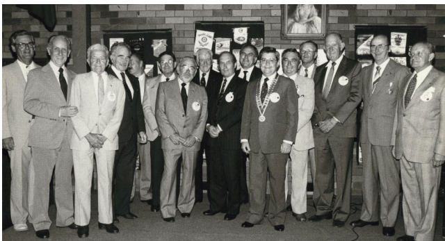
An array of Past Presidents on 14th March, 1985