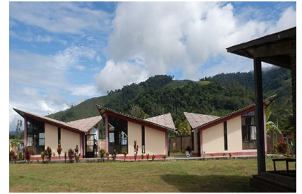
The School built in Satipo