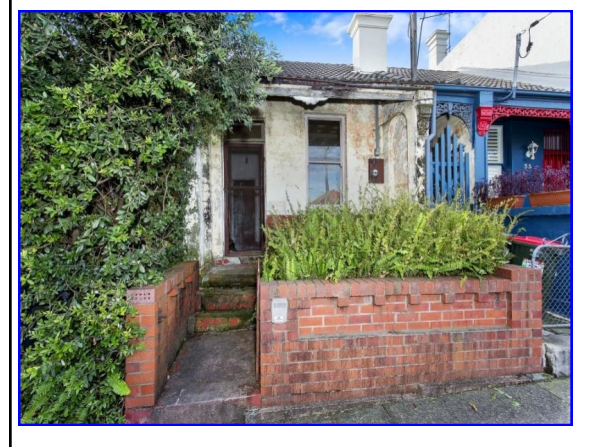
THIS IS HOW IT WAS AT THE START!