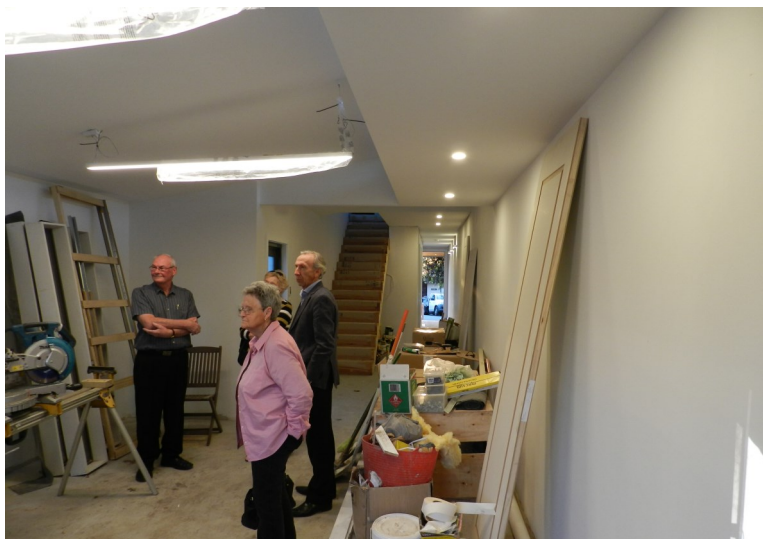
A view of the large open area with stairs leading to the 2nd floor extension and the hallway to the front door.

Adrian walked us through the processes he had to go through to get approval for the renovations. This included his decision to retain the historic nature of the structure, even though the council would have allowed its demolition and a new structure to replace it. The plans he submitted included a second storey towards the rear which had to be modified to prevent shadow on the adjoining property's light well. This second storey houses the master bedroom complete with ensuite bathroom, and also access to extensive storage space in the roof cavity over the front of the house. The floor has been replaced throughout with a concrete slab but the hallway has timber planks recycled from the original floor laid to make it as it was when built. A new main bathroom has been installed between the 2 bedrooms, and an enlarged open area at the end of the hall provides space for a modern kitchen, family room/lounge and laundry. Full width sliding doors open out onto a large rear deck and small garden area.