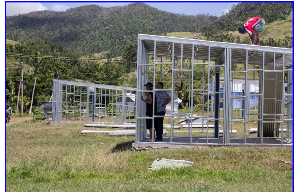
Some of the 15 houses being constructed after the Cyclone Winston devastation

Peter Schultz's website is www.operationfoundationfiji.org/