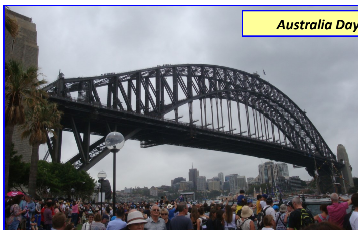
Australia Day 2017 in Sydney