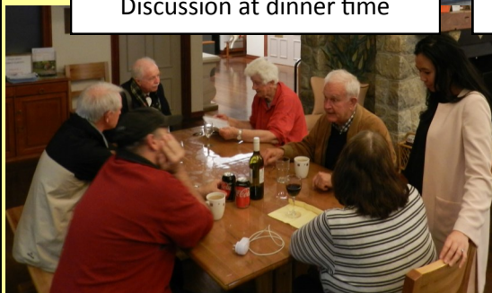
Discussion at dinner time