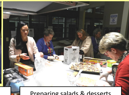
Preparing salads & desserts