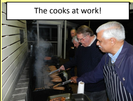
The cooks at work!