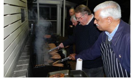
The cooks at work at R M House!