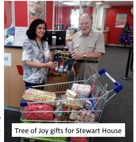
Tree of Joy gifts for Stewart House