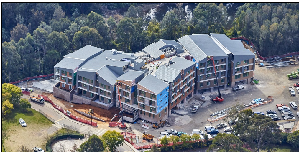
The new Ronald McDonald House Westmead nearing completion.