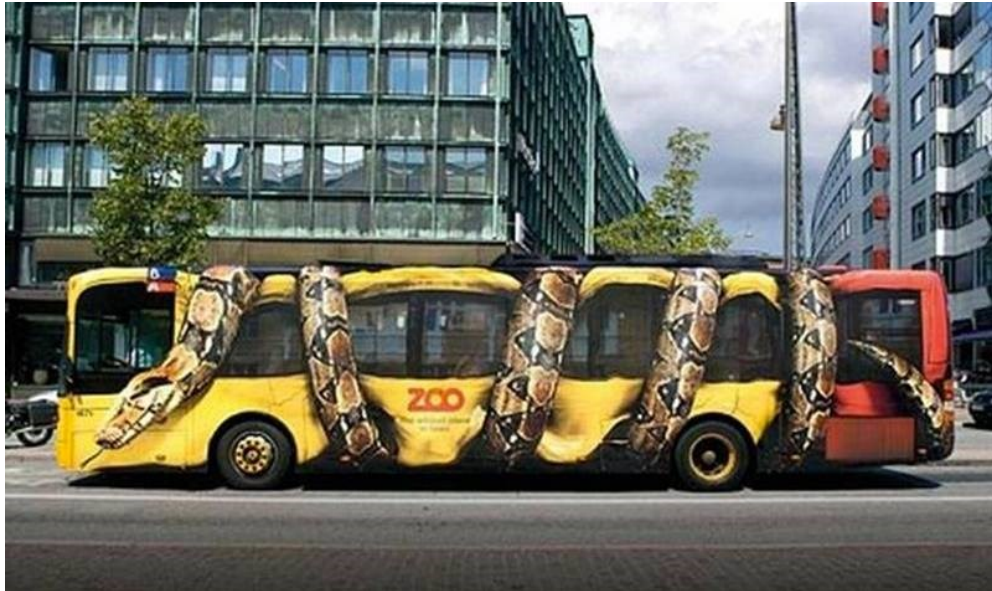
Proposed new public transport advertising for Taronga Zoo?