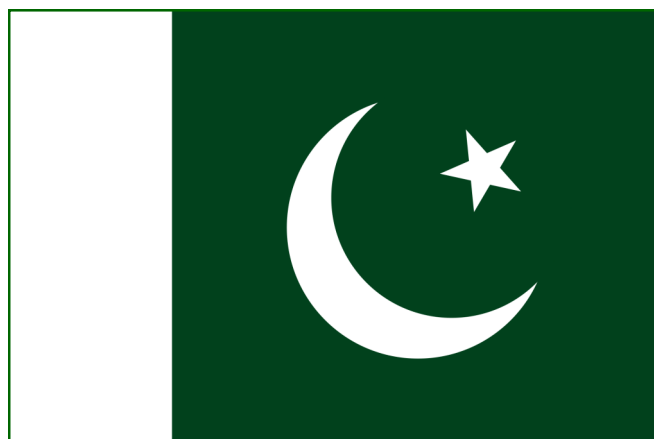
The flag of the Islamic Republic of Pakistan

Tonight we welcome our special Guest Speaker together with our other visitors - our partners.