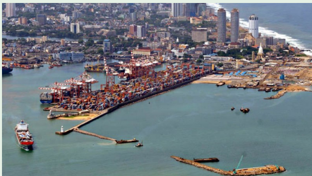
Gwadar Port, part of the China - Pakistan Economic Corridor, has been operational since 2007.

Map of the CPEC Highway development stretching from the China border in the north to Gwadar Port in the west.