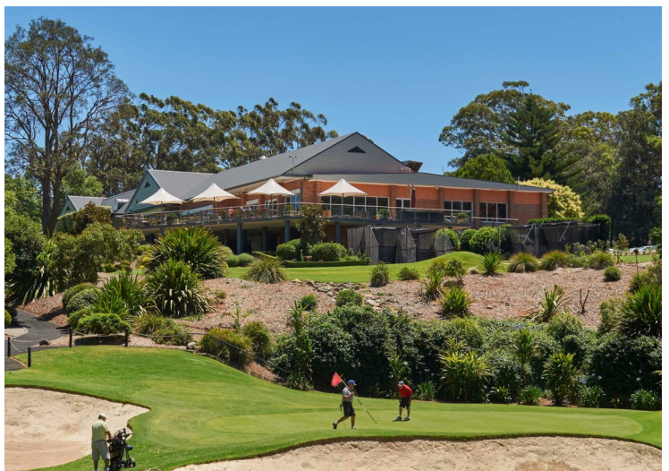
The southern end of the clubhouse before the extensions began