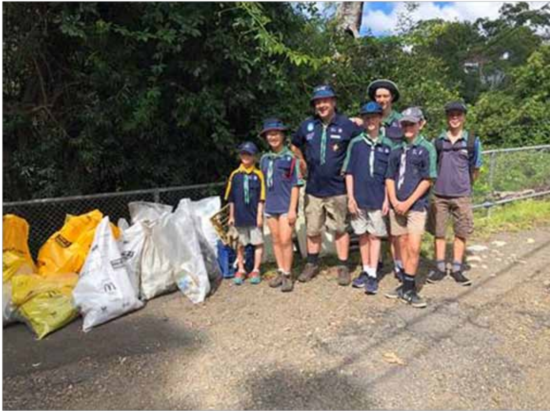
First East Roseville Scouts and Leaders assisting with the clean up.