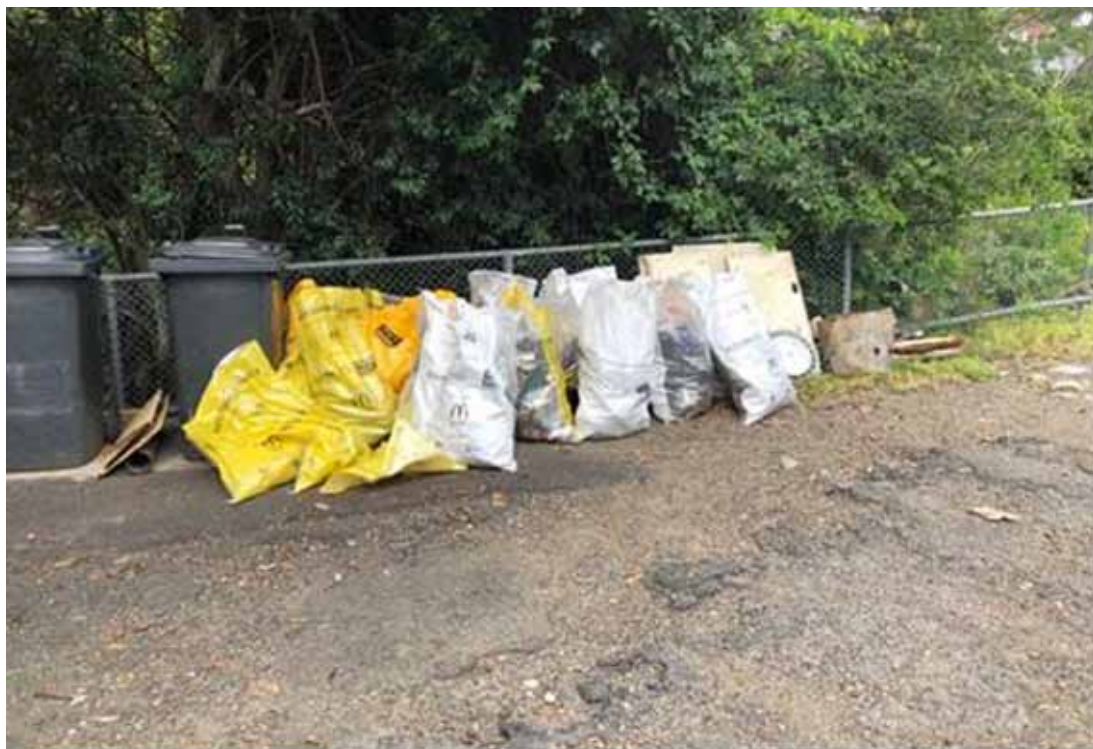
Some of the bags of litter collected on the day.