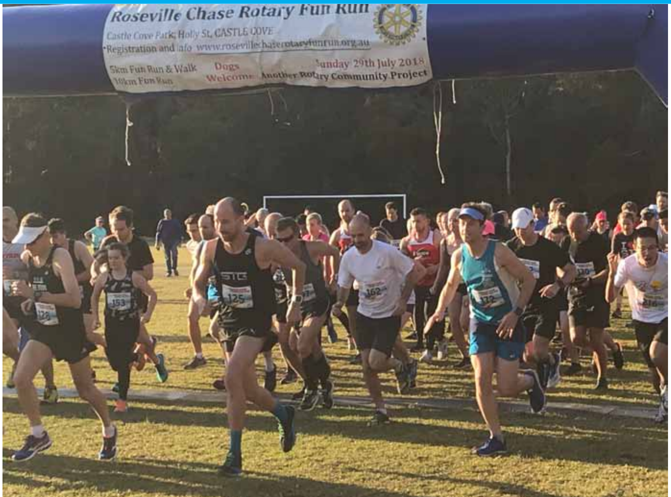
Runners in the 10 km event respond to the starter's gun.