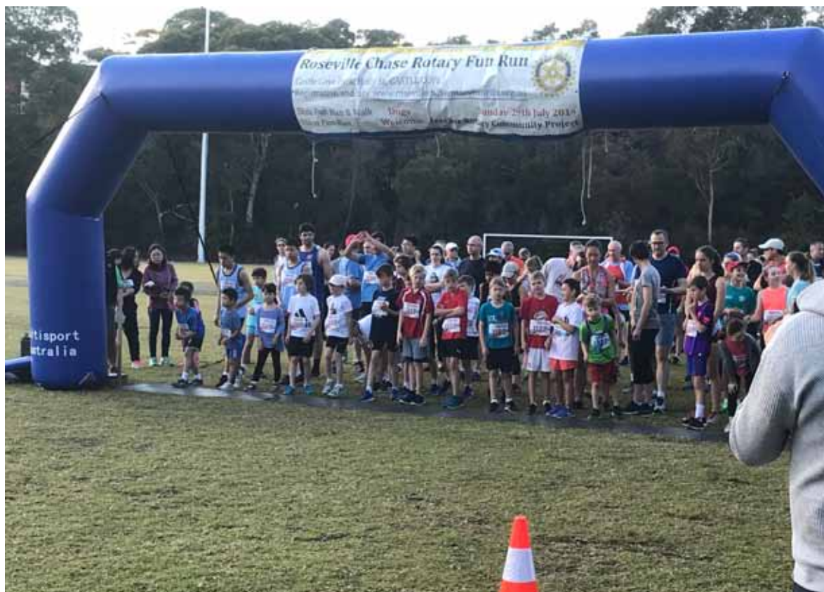
5km runners ready to start