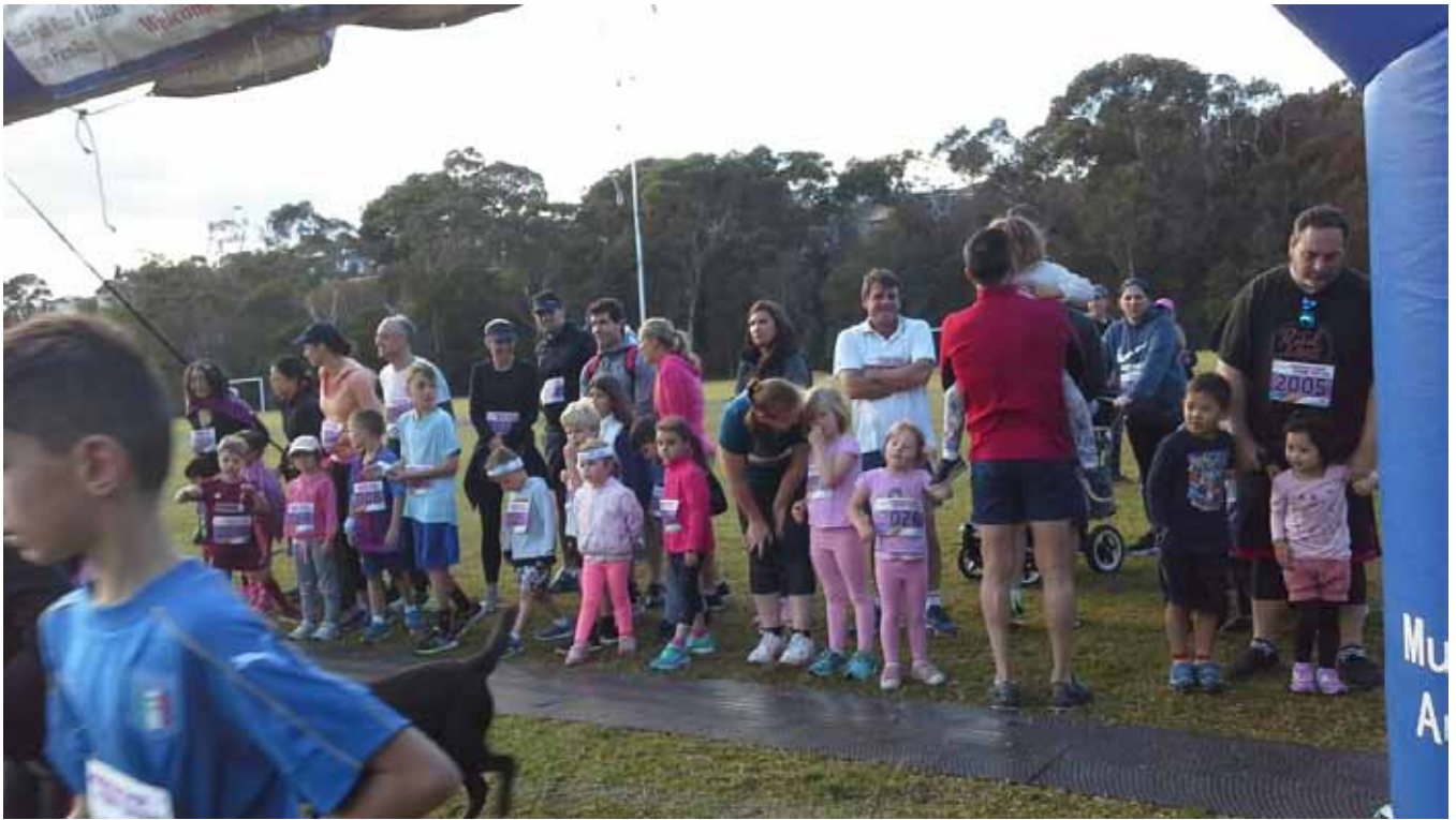
Participants line up for the 2 klm walk/run