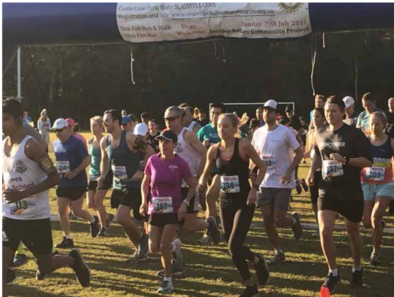
Some serious runners face the early start in the 10 km run