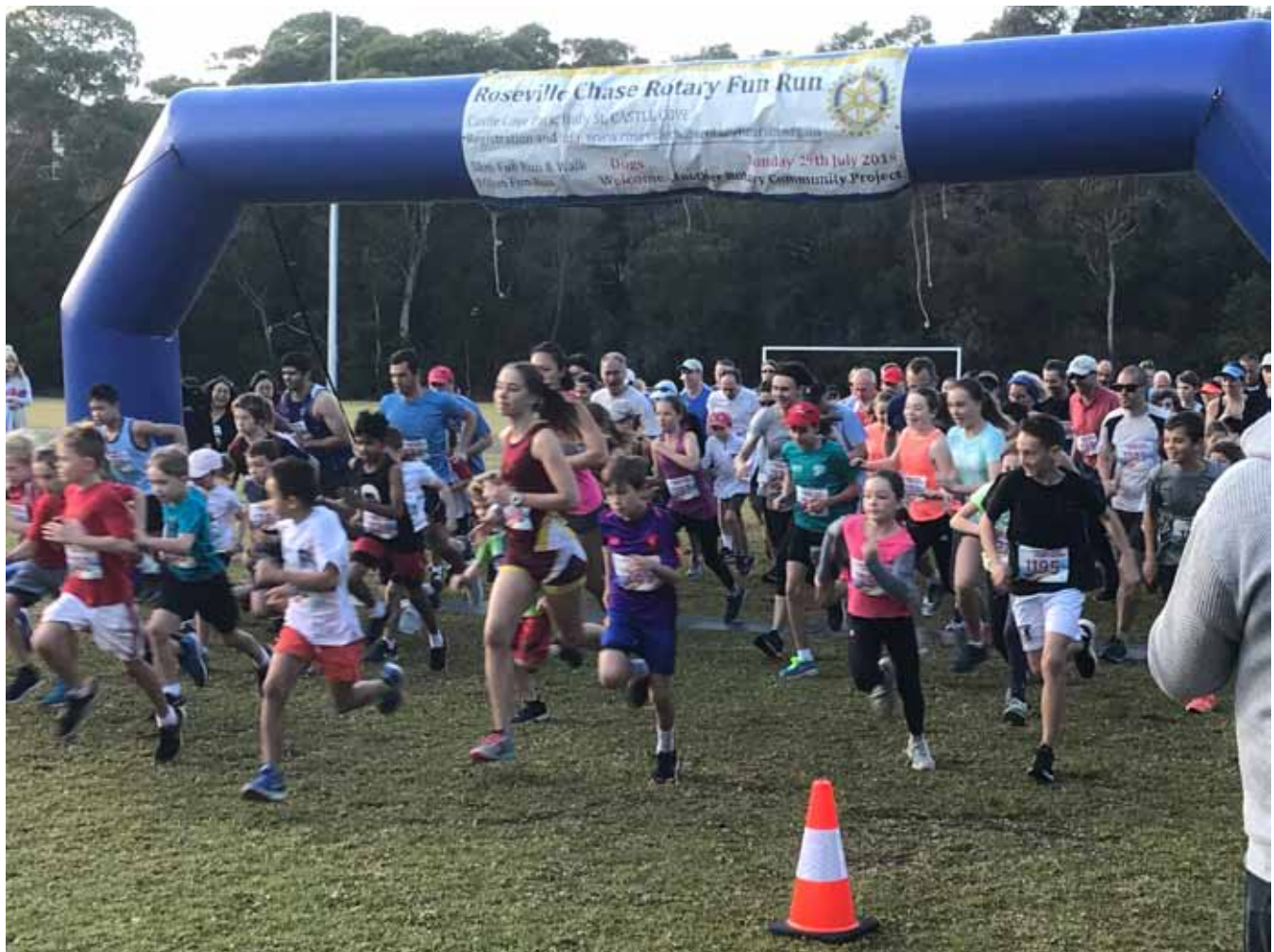
The 5 klm runners start their journey