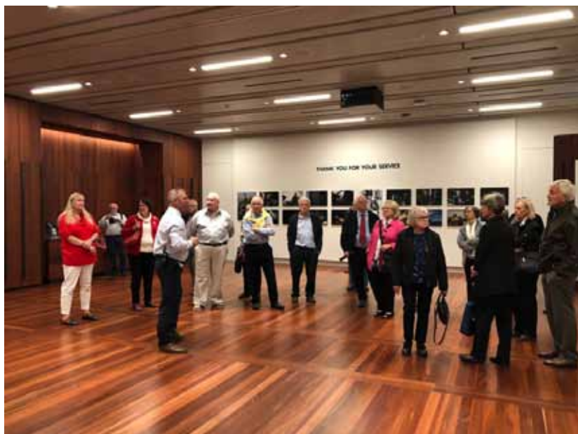
The Auditorium with its marvellous timbered floor and walls.