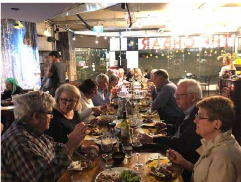
Members and Partners enjoying the Thai Restaruant dinner.