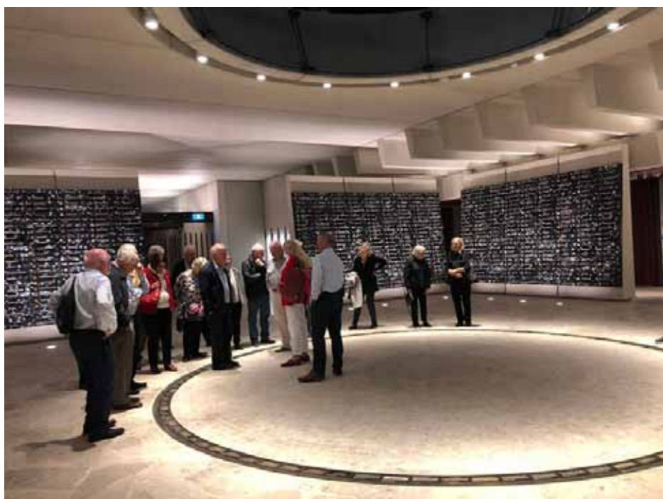
Rotary club members and partners in the Hall of Service.