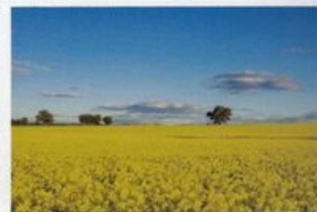
Vast fields of canola

District 9685 Annual Conference 17-19 March 2023