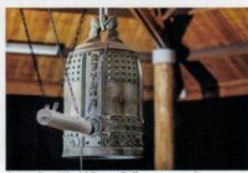
Australian World Peace Bell