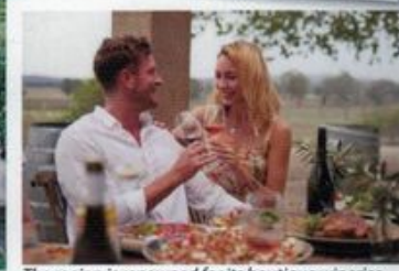
The region is renowned for its boutique wineries