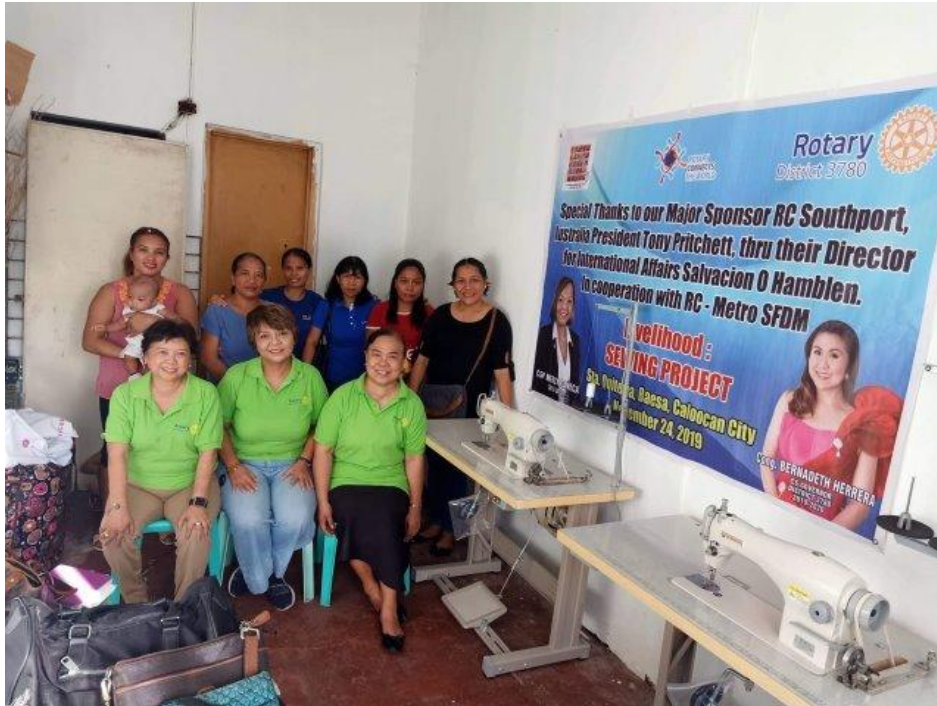
Sewing machines gift from Southport Rotary.