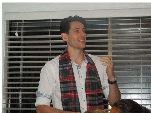
A satellite member has been there three times