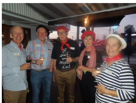
Familiar faces in disguise