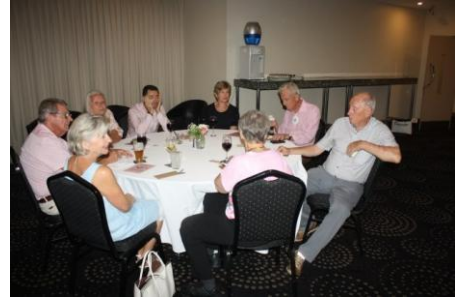
Part of our gathering