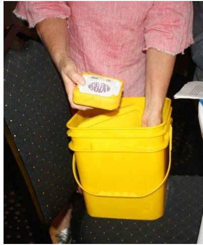
The reusable bucket