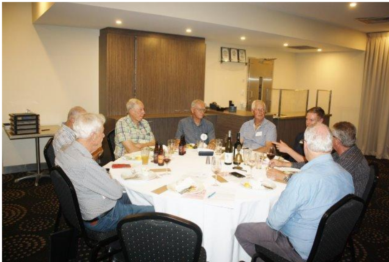
The gathering on 1 March