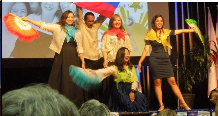
Dance routine from our visitors