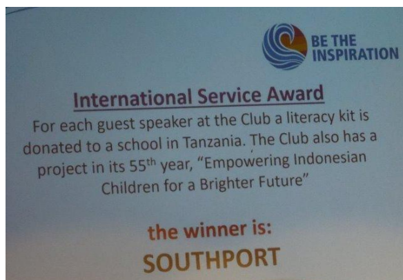
One of our awards