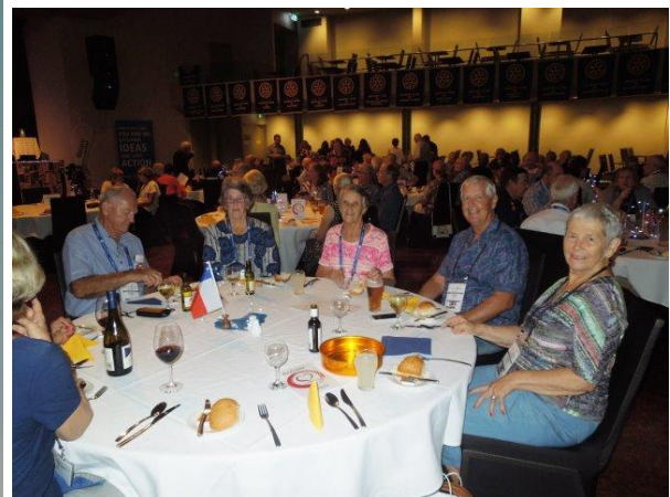
Southport dines at Lismore