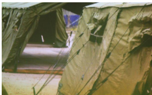
Living quarters for detainees