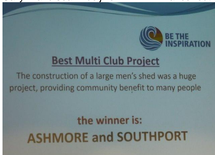
Our second award