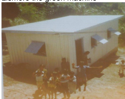
Fiji cyclone proof house