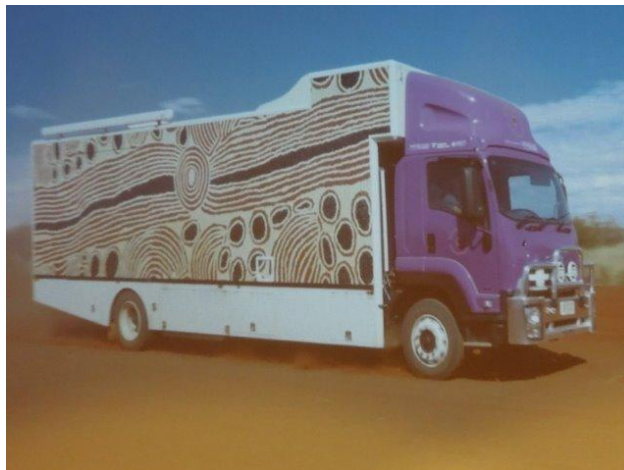
The dialysis truck for remote areas