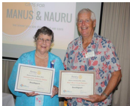
Awards from the conference