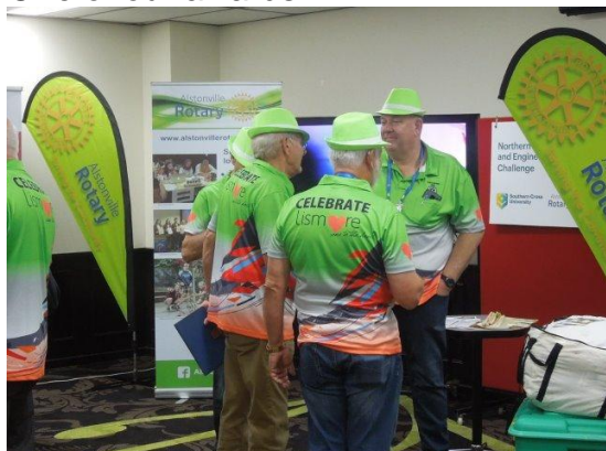
Lismore the green machine