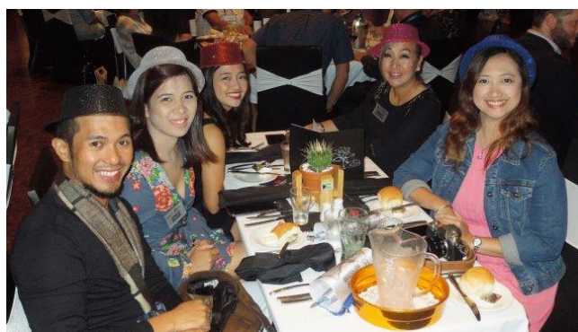
Philippine group hatted up