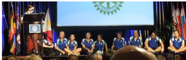
RYLA was there