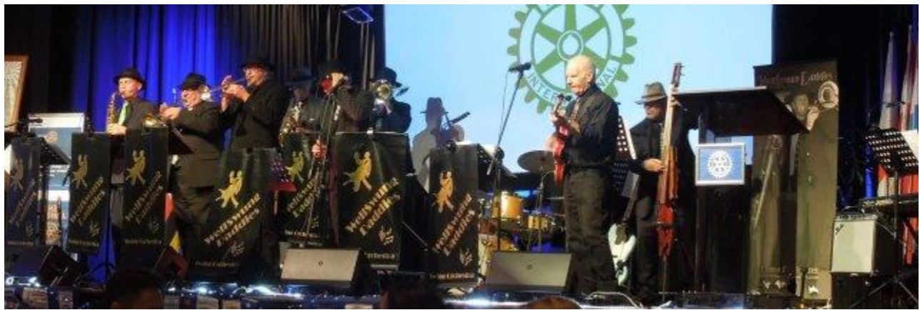
Saturday nights super jazz band