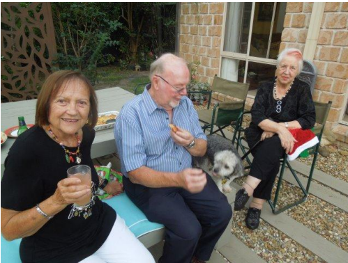
Photos Christmas party.