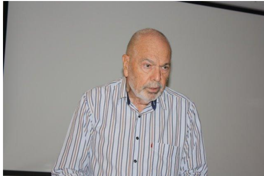
Merv Rotary minute