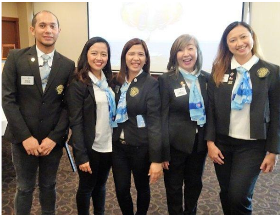
Vocational Exchange Team