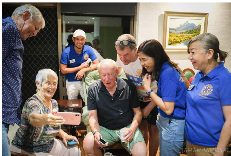
The selfie group