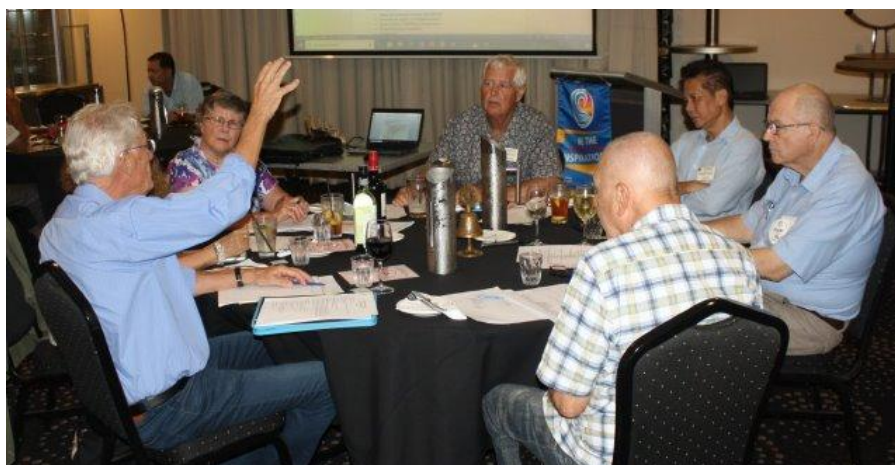
The Board meeting