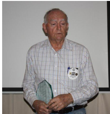
Lionel meals on wheels