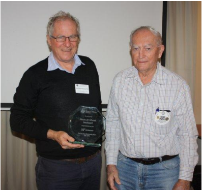
Presentation of Plaque