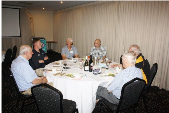
The dinner group.