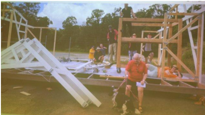
Arundel mens shed construct prefab annex