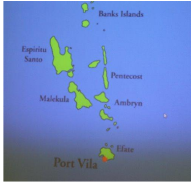
Map of Vanuatu