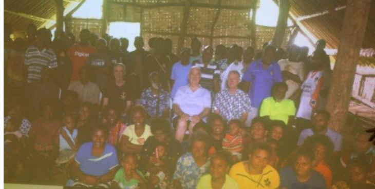
Warm welcome to visitors