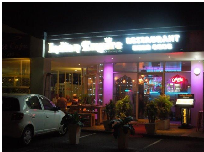
The dining venue