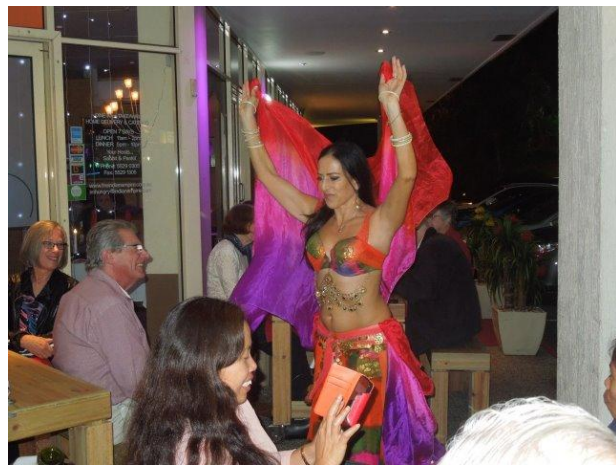
Pres Graham checks the entertainment