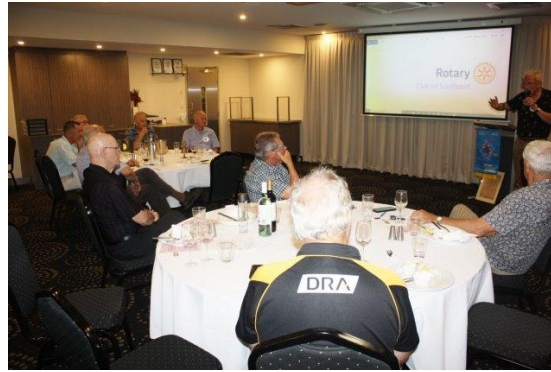
Our small gathering