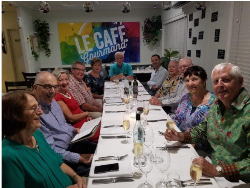
Christmas party Le Gourmand 17 December