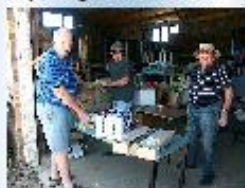
The expert book packers from the Satellite Club of Tenterfield - The Granite Belt

One of the unusual things regarding the packing of this container has been the assistance given by the 11 students and 3 teachers from the Magadro School, Fiji who were here in Stanthorpe for a two week Cultural Exchange with St. Joseph's School, Stanthorpe. They not only enjoyed assisting with the packing of the container but more importantly gained an appreciation of the time and effort that goes into the collection of items and subsequent packing. I'm sure when the contents finally arrive at their school they will proudly say - "I witnessed and assisted with the packing of the container!"