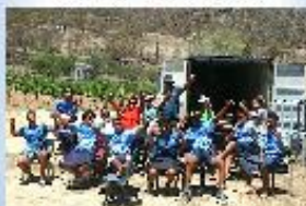
Students and teachers from the Magadro School taking a rest from packing - Angelo's vineyard in the background