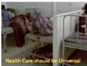
Health Care should be Universal

23-25 Mary Street Kingston Mobile: 0488 658 042 Email: dlr.rawcsnorthern@gmail.com December 2019 Edition No. 34