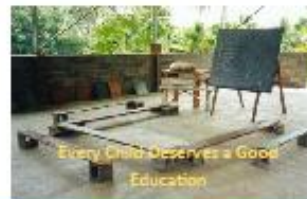
Every Child Deserves a Good Education

23-25 Mary Street Kingston Mobile: 0488 658 042 Email: dlr.rawcsnorthern@gmail.com December 2019 Edition No. 34