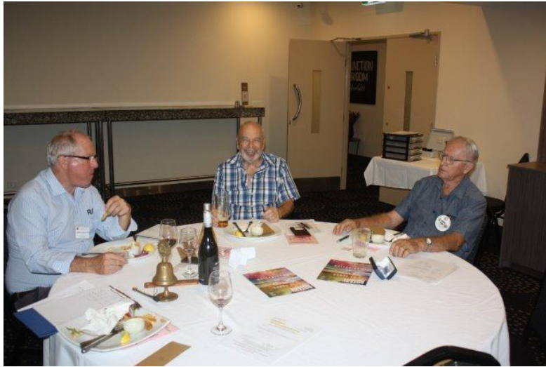
The modest gathering