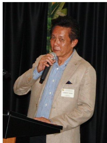
Lambert RI toast to Hope Island