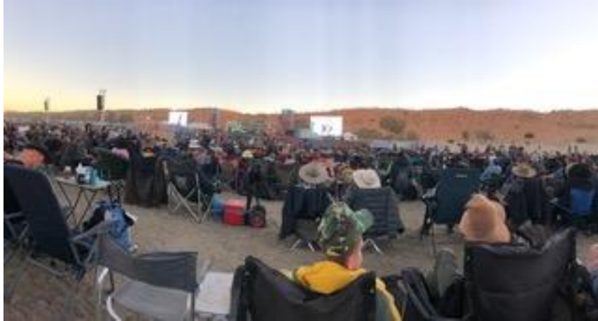
Big Red Bash