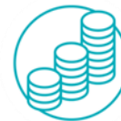
COMMUNITY ECONOMIC DEVELOPMENT