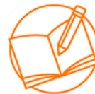
BASIC EDUCATION AND LITERACY