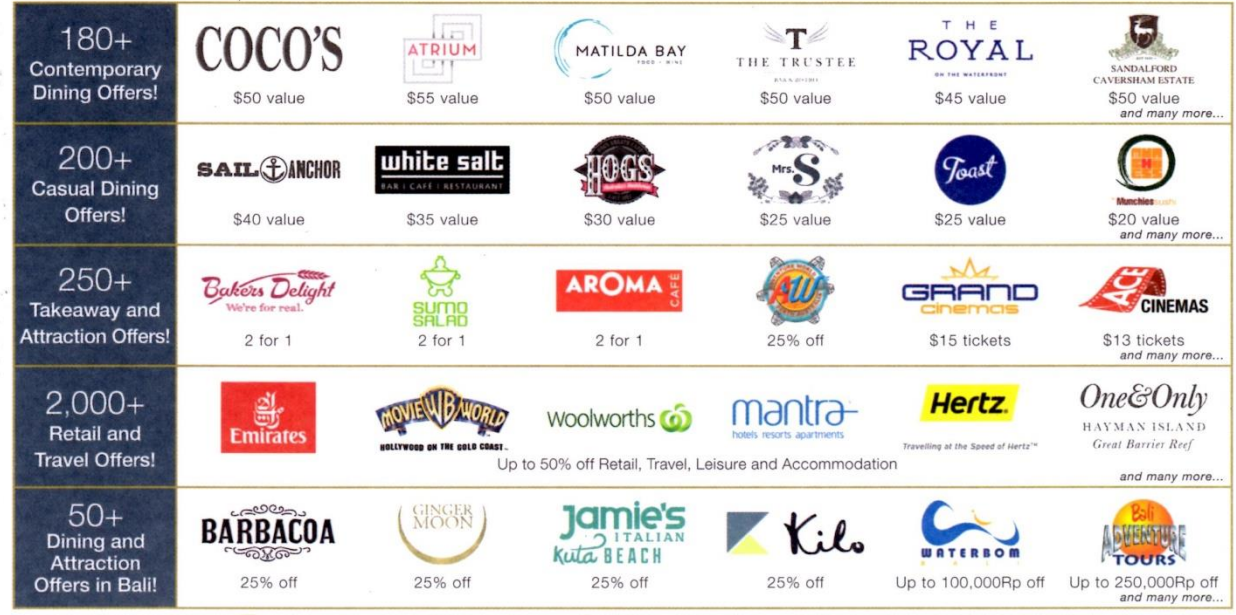
Every sale contributes to our fundraiser, so purchase yours today!