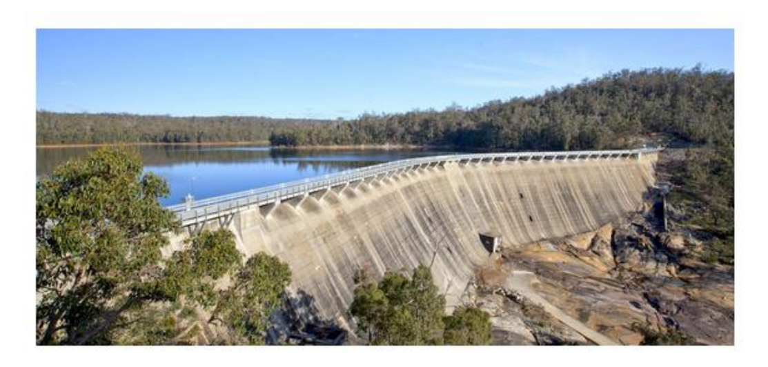
DISTRICT 9465 CONFERENCE will be at COLLIE on 22 - 24 March 2019