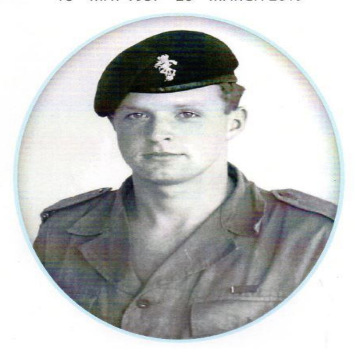
Pinnaroo Valley Chapel & Crematorium Tuesday 9th April, 2:30pm