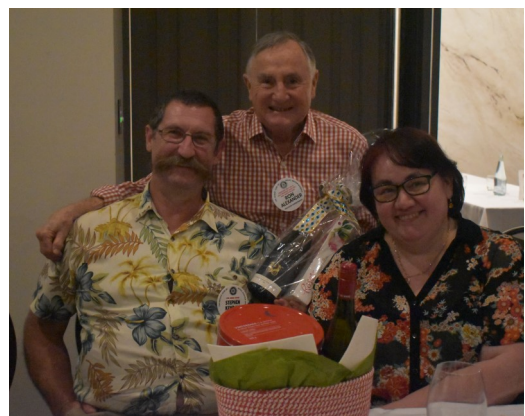
Our Raffle Winners for the evening