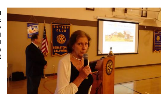
No Pin = $5. The fines were collected at each table.

Rotary Day at Laguna Environmental Center — Ellen Harrington has arranged for this volunteer opportunity on Saturday, September 24<sup>th</sup> from 9AM to 3PM (lunch provided) at 900 Sanford Rd (corner of Occidental Rd.), Santa Rosa Please RSVP to Ellen at classical_home@msn.com