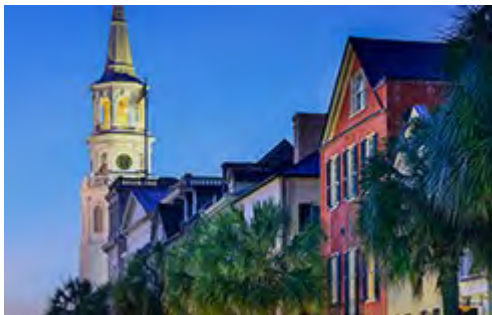
Charleston Luxury Getaway