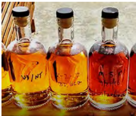
Kentucky Bourbon Trail