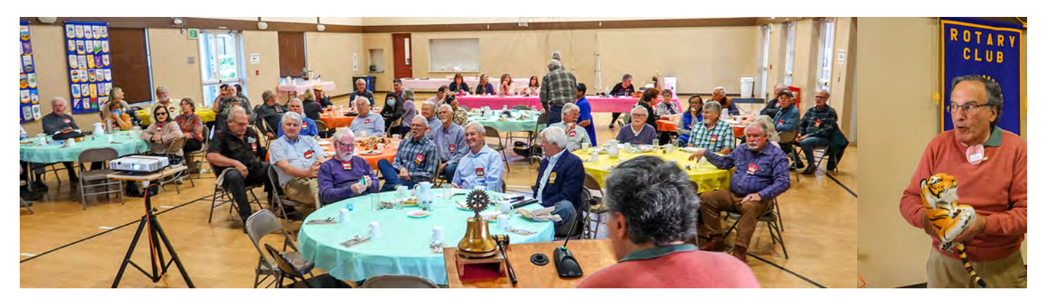
The $1000 Sebastopol Hardware Shopping Spree should gross $100K. So everybody get out there and sell, sell, sell raffle tickets! We'll see you May 7th.