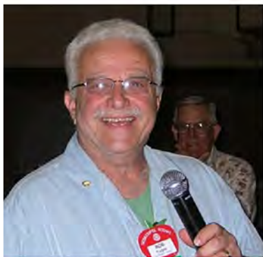
Induction of New Members