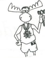
He wanted to show his new Olympic physique.