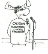
He waited for everyone a LONG TIME.