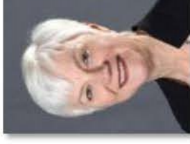
RI DIRECTOR ZONE 8 2021-23